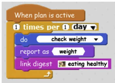
Figure 1.3 This mockup shows a fragment of a self-care plan to prompt the user once a day to record his weight. The variable weight is defined elsewhere as being of type number, so the user will be prompted to enter a number. This request also recommends an information digest about healthy eating.

he feedback on the monitoring of those activities to the caregiver and/or a clinician